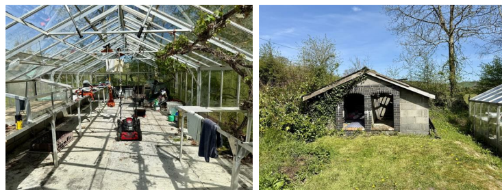
Feature greenhouse and small building